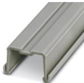
Cover profile, length: 1 m

Please be informed that the data shown in this PDF Document is generated from our Online Catalog. Please find the complete data in the user's documentation. Our General Terms of Use for Downloads are valid ( http://phoenixcontact.com/download )