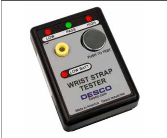
Figure 1. Desco 19240 Wrist Strap Tester