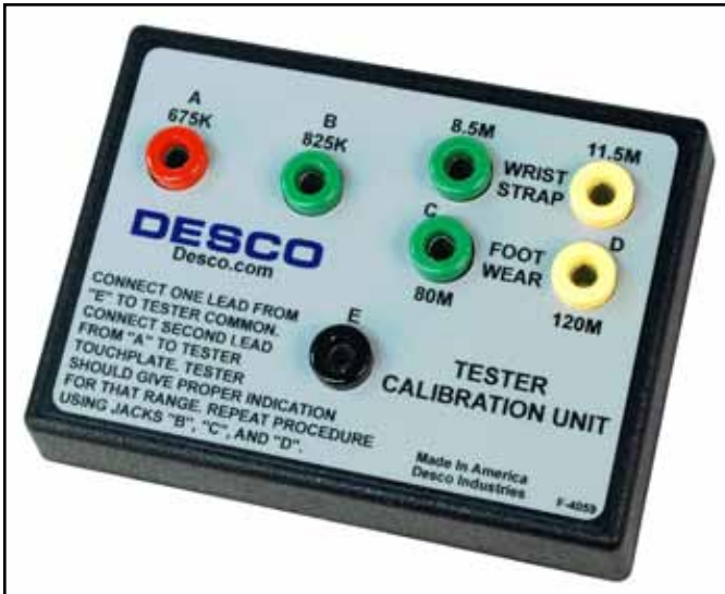
Figure 3. Desco 07010 Calibration Unit

View technical bulletin TB-2039 for more information on the 07010 Calibration Unit and instructions to calibrate the Wrist Strap Tester.