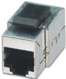
RJ45 socket insert, modular (Keystone), CAT3, 8-pos., shielded, with cable connection (IDC)

Please be informed that the data shown in this PDF Document is generated from our Online Catalog. Please find the complete data in the user's documentation. Our General Terms of Use for Downloads are valid ( http://download.phoenixcontact.com )