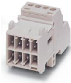
Contact insert module, for panel mounting frames, with screw connection, 7-pos. + PE connection, 160 V / 10 A

Please be informed that the data shown in this PDF Document is generated from our Online Catalog. Please find the complete data in the user's documentation. Our General Terms of Use for Downloads are valid ( http://download.phoenixcontact.com )