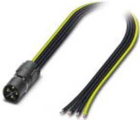
Assembled contact carrier and insulating body, S-coding, 3-pos. + PE, 0.5 m long litz wires

Please be informed that the data shown in this PDF Document is generated from our Online Catalog. Please find the complete data in the user's documentation. Our General Terms of Use for Downloads are valid ( http://download.phoenixcontact.com )