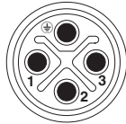
M12 plug pin assignment, 4-pos., S-coded, plug side view