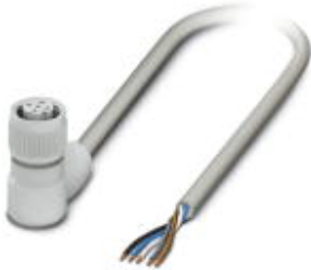
Sensor/Actuator cable, 5-position, PP-EPDM halogen-free, Gray RAL 7035, Free cable end, on Socket angled M12, A-coded, Cable length: 5 m, Hygienic design, with plastic knurl

Please be informed that the data shown in this PDF Document is generated from our Online Catalog. Please find the complete data in the user's documentation. Our General Terms of Use for Downloads are valid ( http://download.phoenixcontact.com )