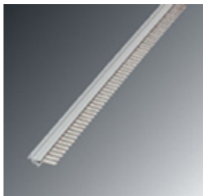
Plug-in bridge, pitch: 5.2 mm, number of positions: 80, color: gray

Please be informed that the data shown in this PDF Document is generated from our Online Catalog. Please find the complete data in the user's documentation. Our General Terms of Use for Downloads are valid ( http://phoenixcontact.com/download )