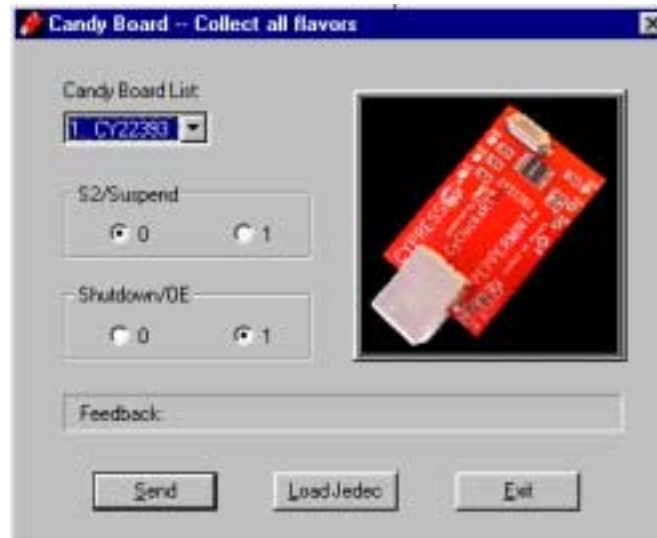
Figure 1. Candy Board Set-up Window

Windows is a trademark of Microsoft Corporation. CYClocksRT™ is a trademark of Cypress Semiconductor Corporation. All product and company names mentioned in this document are the trademarks of their respective holders.