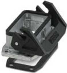
HEAVYCON panel mounting base, B10, with single locking latch, with flat gasket, salt-water-resistant aluminum, conductive profile gasket

Please be informed that the data shown in this PDF Document is generated from our Online Catalog. Please find the complete data in the user's documentation. Our General Terms of Use for Downloads are valid ( http://phoenixcontact.com/download )