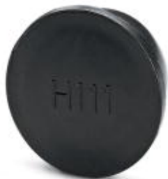
Plastic dust protection cap, anti-static, for connectors with M23 knurled nuts

Please be informed that the data shown in this PDF Document is generated from our Online Catalog. Please find the complete data in the user's documentation. Our General Terms of Use for Downloads are valid ( http://phoenixcontact.com/download )