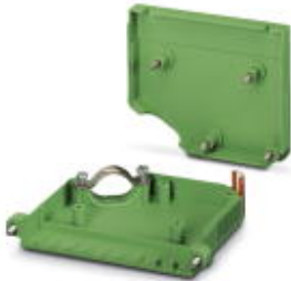
Cable housing, Pitch: 0 mm, Number of positions: 6, Dimension a: 47.52 mm, Color: green

Please be informed that the data shown in this PDF Document is generated from our Online Catalog. Please find the complete data in the user's documentation. Our General Terms of Use for Downloads are valid ( http://download.phoenixcontact.com )