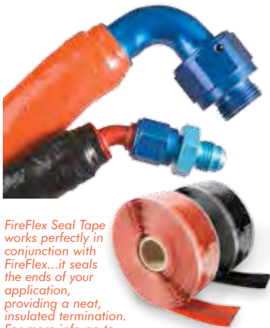
FireFlex Seal Tape works perfectly in conjunction with FireFlex...it seals the ends of your application, providing a neat, insulated termination. For more info go to page 95.