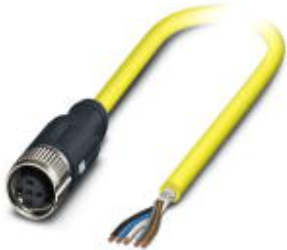
Sensor/Actuator cable, 5-position, PVC, yellow RAL 1021, shielded, free cable end, on Socket straight M12 SPEEDCON, A-coded, Cable length: 15 m

Please be informed that the data shown in this PDF Document is generated from our Online Catalog. Please find the complete data in the user's documentation. Our General Terms of Use for Downloads are valid ( http://phoenixcontact.com/download )