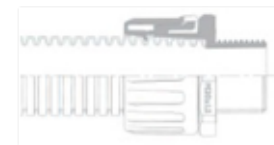
Conduit complete with FPA fitting