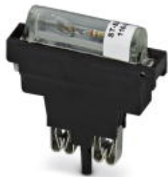
Fuse plug, nominal current: 10 A, length: 45.4 mm, width: 9.9 mm, color: black

Please be informed that the data shown in this PDF Document is generated from our Online Catalog. Please find the complete data in the user's documentation. Our General Terms of Use for Downloads are valid ( http://phoenixcontact.com/download )