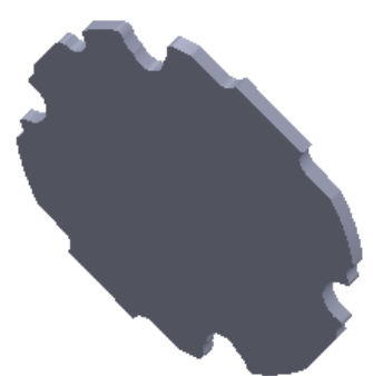
3D View Scale:- 2:1