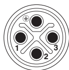
Connector pin assignment of M12 plug, 4-pos., S-coded, view of pin side