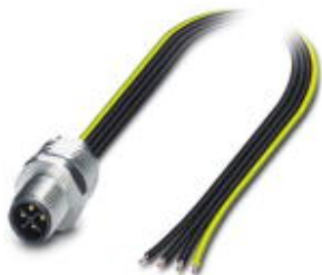
Sensor/actuator flush-type plug, 4-pos., front/screw mounting with M16 thread, with 0.5 m PP litz wire, 4 x 1.5 mm 2

Please be informed that the data shown in this PDF Document is generated from our Online Catalog. Please find the complete data in the user's documentation. Our General Terms of Use for Downloads are valid ( http://phoenixcontact.com/download )