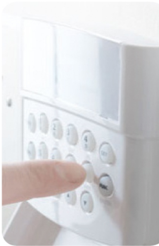
Smart Energy Home