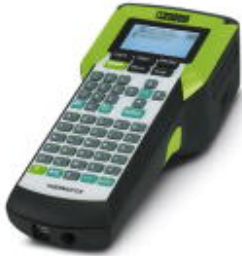
Portable thermal transfer printer for roll material

Please be informed that the data shown in this PDF Document is generated from our Online Catalog. Please find the complete data in the user's documentation. Our General Terms of Use for Downloads are valid ( http://phoenixcontact.com/download )