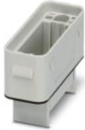
Plastic panel mounting base for modules for a module slot, without PE marking, for snap locking

Please be informed that the data shown in this PDF Document is generated from our Online Catalog. Please find the complete data in the user's documentation. Our General Terms of Use for Downloads are valid ( http://download.phoenixcontact.com )