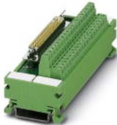
VARIOFACE module, with screw connection and D-subminiature pin strip, for assembly on NS 35/7.5, 25 positions

Please be informed that the data shown in this PDF Document is generated from our Online Catalog. Please find the complete data in the user's documentation. Our General Terms of Use for Downloads are valid ( http://download.phoenixcontact.com )