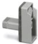
Sealing plate, Color: gray