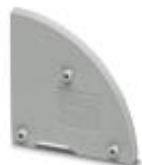
Spacer plate, Color: gray