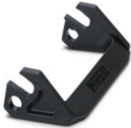
Replacement single locking latch for HEAVYCON EVO housing type B16, PA

Please be informed that the data shown in this PDF Document is generated from our Online Catalog. Please find the complete data in the user's documentation. Our General Terms of Use for Downloads are valid ( http://phoenixcontact.com/download )